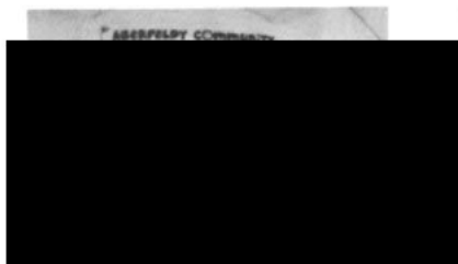
Some of the team!